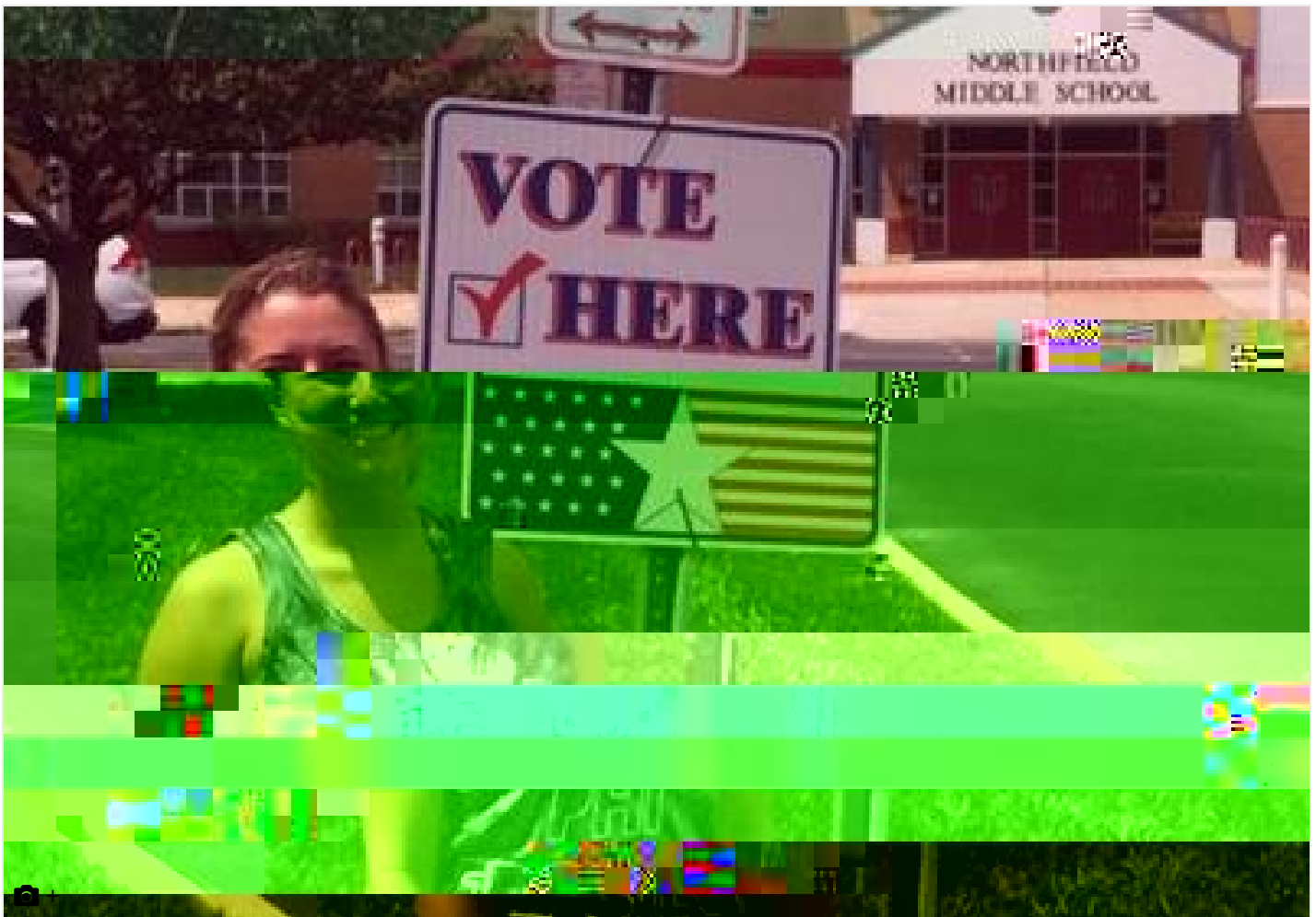
Some voters insist on going to polls despite vote-by-mail election