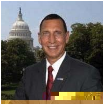
Rep. Frank LoBiondo